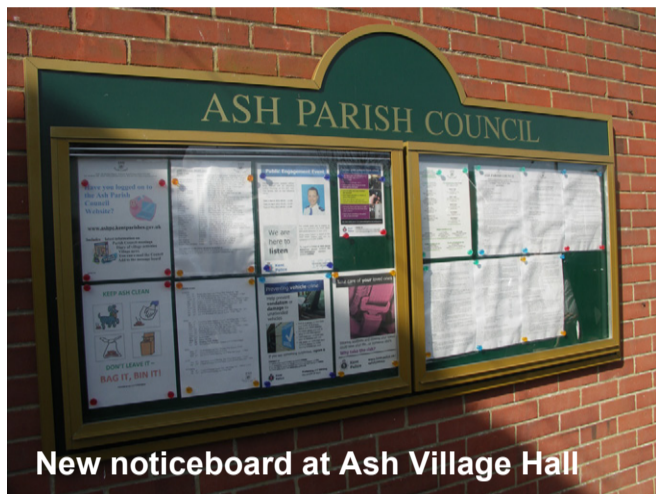
New noticeboard at Ash Village Hall