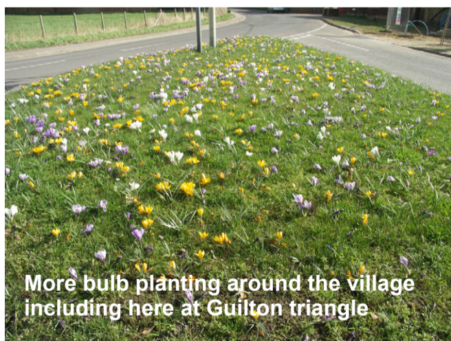
More bulb planting around the village including here at Gulton triangle