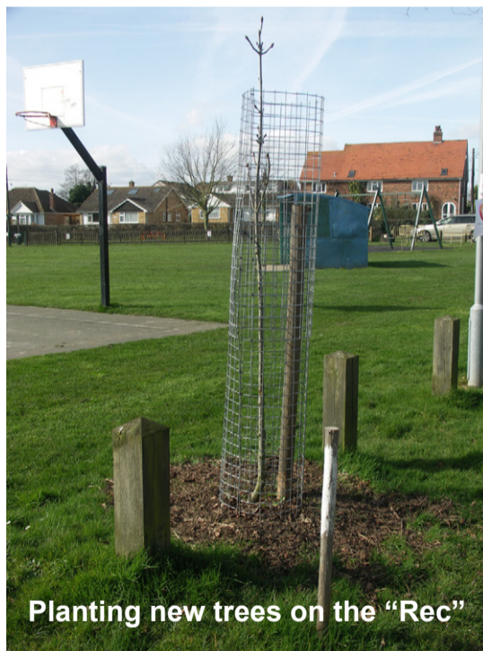
Planting new trees on the "Rec"