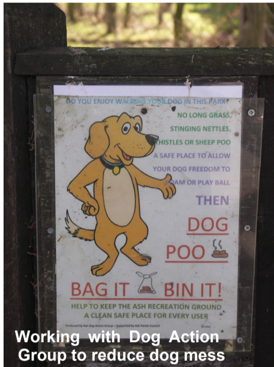
Working with Dog Action Group to reduce dog mess