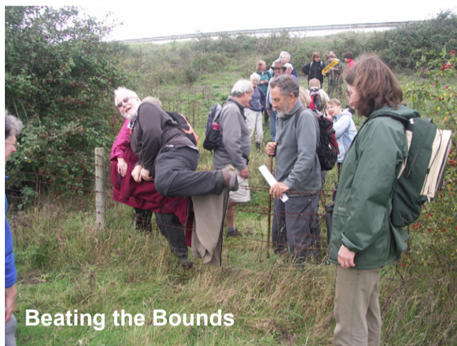
Beating the Bounds